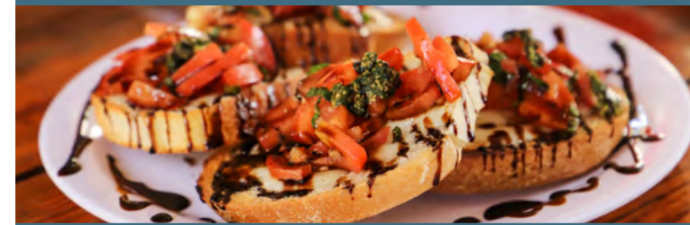
Mamma Mia's Pizzeria