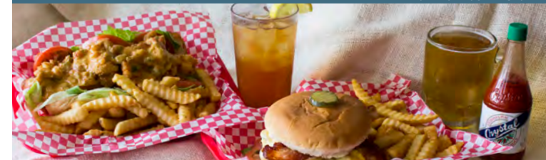
Fish River Grill